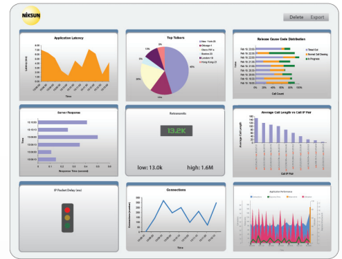
NetOmni™ Dashboard with Dynamic Alarms

By interfacing with remote subsets of the larger network to collect and collate information into the NIKSUN Network Knowledge Warehouse, the NetOmni Suite offers organizations the unique ability to make fast and accurate decisions from a central enterprise-wide portal to assure network service levels and protect data integrity. Users can identify, correlate and resolve performance, security and compliance issues immediately through real-time, actionable alerts that provide easy access from applications down to packet-level information via the Network Knowledge Warehouse. This integration greatly speeds up the process of accurate and efficient incident response, forensic analysis and reduces MTTR by enabling problem resolution in minutes as opposed hours or even days taken by non-correlated and manual analysis processes offered by legacy solutions and tools.